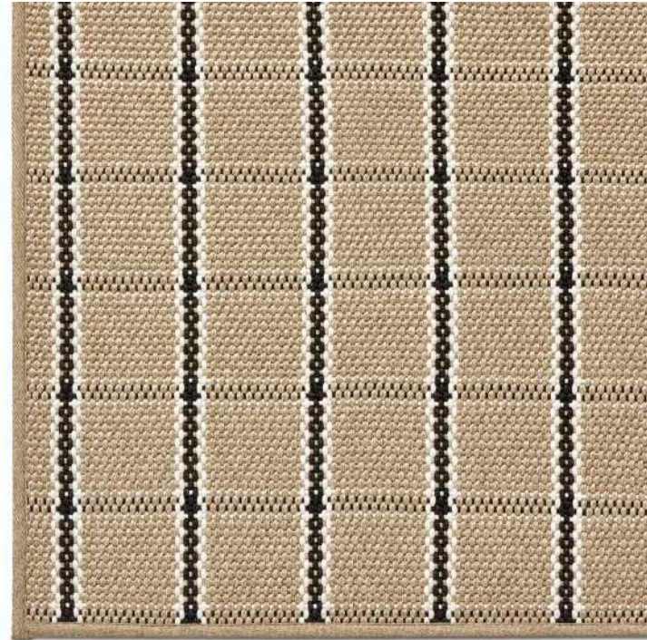
Terra Gobi Coconut White with \pm 2 cm Rustic Band