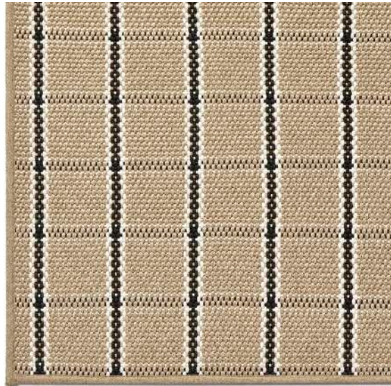
Gobi Coconut White