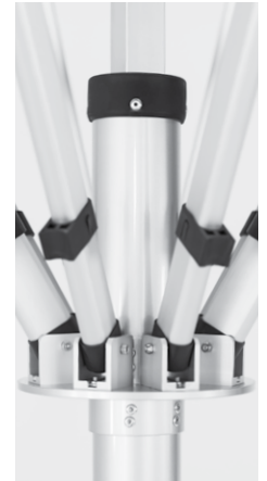
ALUMINIUM HUBS AND ARM CONNECTORS