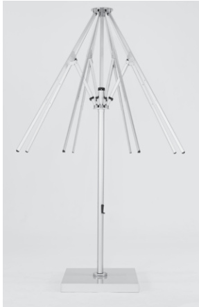
MARINE GRADE ALUMINIUM FRAME

environments that require a large but durable shade solution. What sets the Tempest apart from other options is its strength and ability to withstand wind. The umbrella is rated to withstand wind gusts of 80-100kph giving business owner's peace of mind and time to close the umbrellas when adverse weather suddenly arrives.