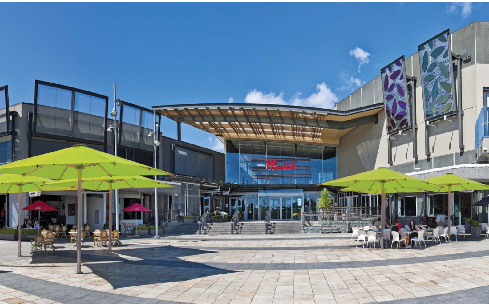
6 x Tempest 4m Square umbrellas with Pistachio R160 fabric. Installed at Westfield Albany.