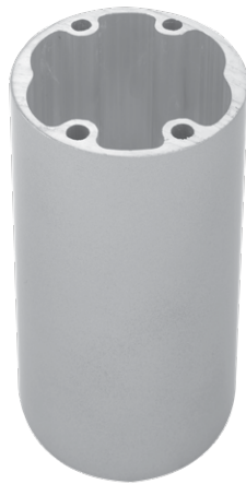
HEAVY DUTY 94MM DIA. ALUMINIUM MAST