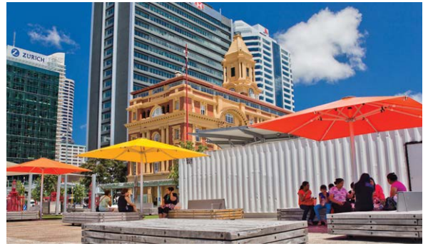
3.5m Square Tempests installed for Auckland Council at Queens Wharf

This heavy-duty giant telescopic umbrella is built super-strong and is engineered to withstand wind gusts of 80-100km/h while open. The canopy arms are made from reinforced aluminium that is connected to an impressive 94mm mast with internal reinforcing channels for extra strength. The Tempest is quite simply the best non-permanent umbrella on the market today.