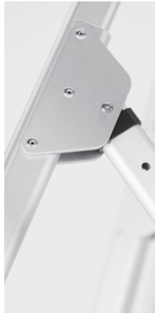
DOUBLE REINFORCED JOINTS