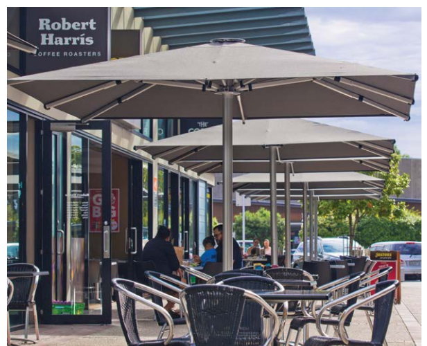
Tempest 3.5m Square umbrellas. Installed around The Base Shopping Mall, Hamilton.