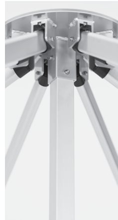
DURABLE TELESCOPIC MAST & TOP HUB