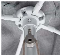
DURABLE STAINLESS STEEL PULLEYS & FIXINGS