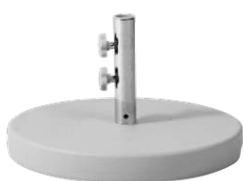
30KG CONCRETE FILLED BASE

You can either use your umbrella with a freestanding base or instead install it using our stainless steel Removable Spigot System. The base plate is bolted down to a timber deck or a concrete patio and the removable spigot is then fixed to the base plate.