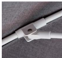
SUPER STRONG FIBREGLASS ARMS & JOINTS