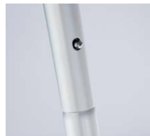
HEAVY DUTY 38MM DIAMETER ALUMINIUM SPLIT POLE