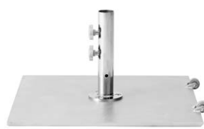
40KG PREMIUM WHEEL BASE