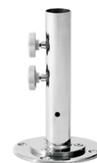
REMOVABLE SPIGOT SYSTEM For installation onto a wooden deck or concrete patio.