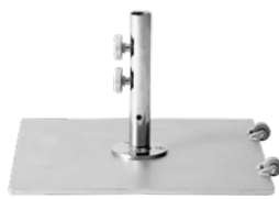
30KG PREMIUM WHEEL BASE