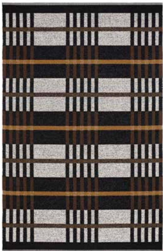
Rug 210x320 cm, First Snow 850

Design GUNILLA LAGERHEM ULLBERG Woven bouclé rug in pure wool and linen