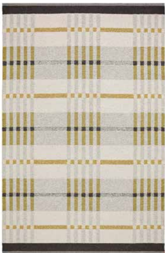
Rug 210x320 cm, Frosty Plains 540