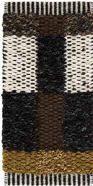
Potato Field 580