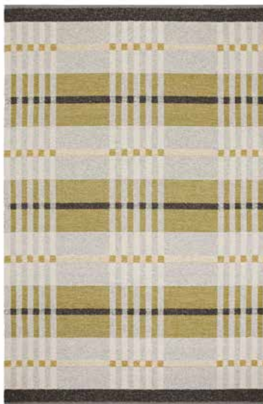
Rug 210x320 cm, Yellow Rye 450