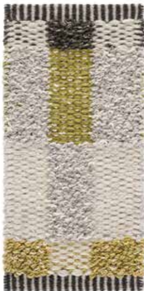
Frosty Plains 540

Design GUNILLA LAGERHEM ULLBERG Woven bouclé rug in pure wool and linen