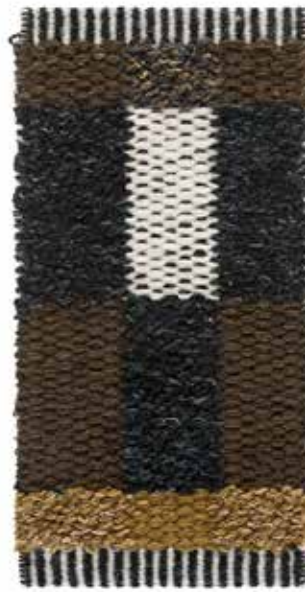
First Snow 850