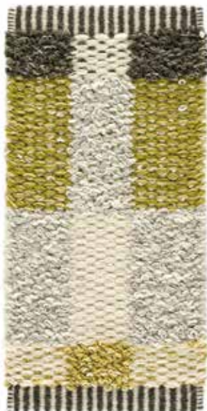
Yellow Rye 450