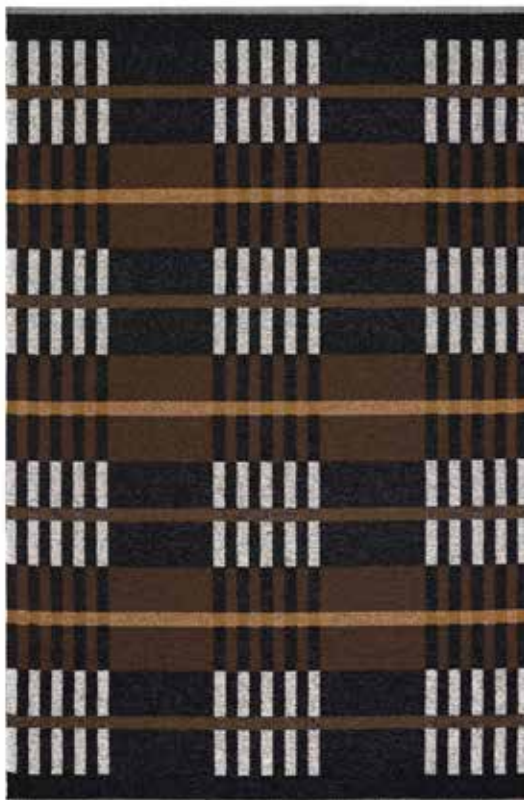
Rug 210x320 cm, Potato Field 580