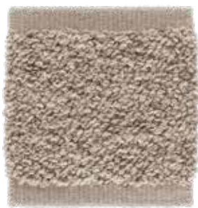
Powder Greige 804