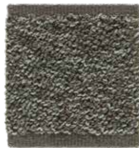
Ash Grey 551