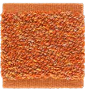
Tangerine Orange 441