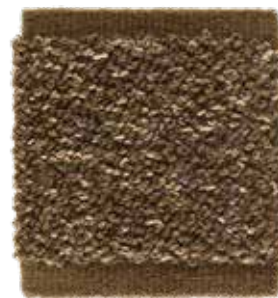
Bark Green 301