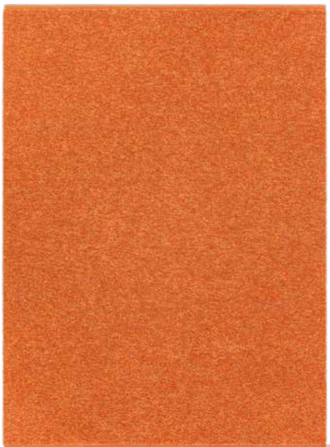
Rug 170x240 cm, Tangerine Orange 441