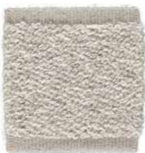
Soft Grey 850-8005