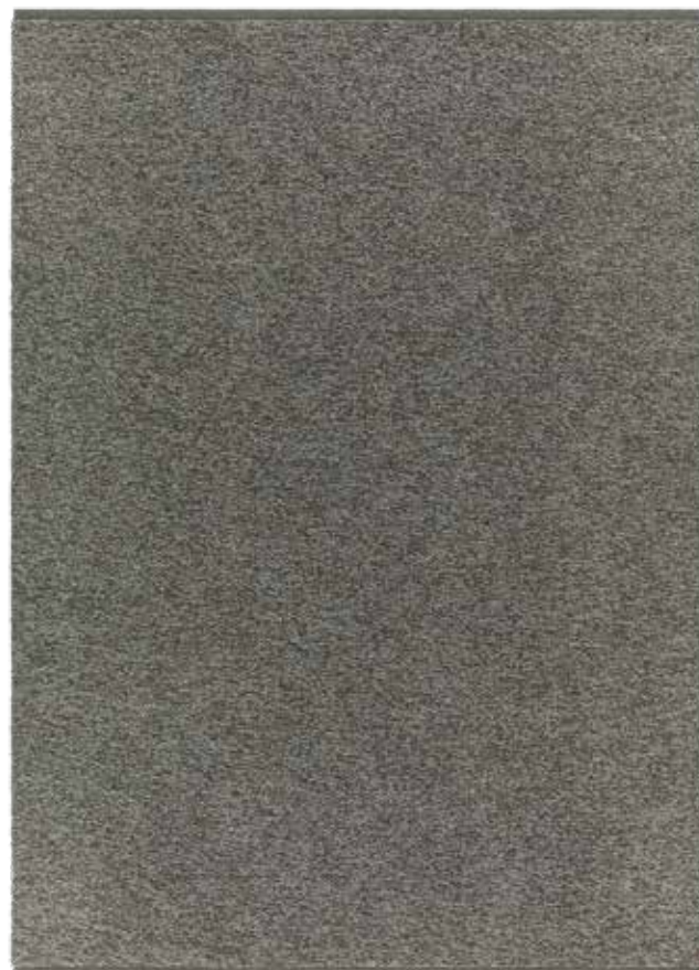
Rug 170x240 cm, Ash Grey 551