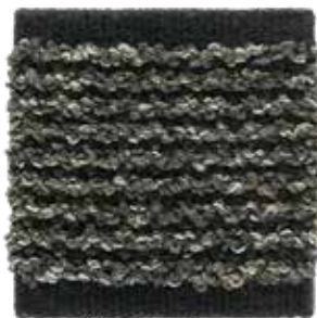
Black tea 500