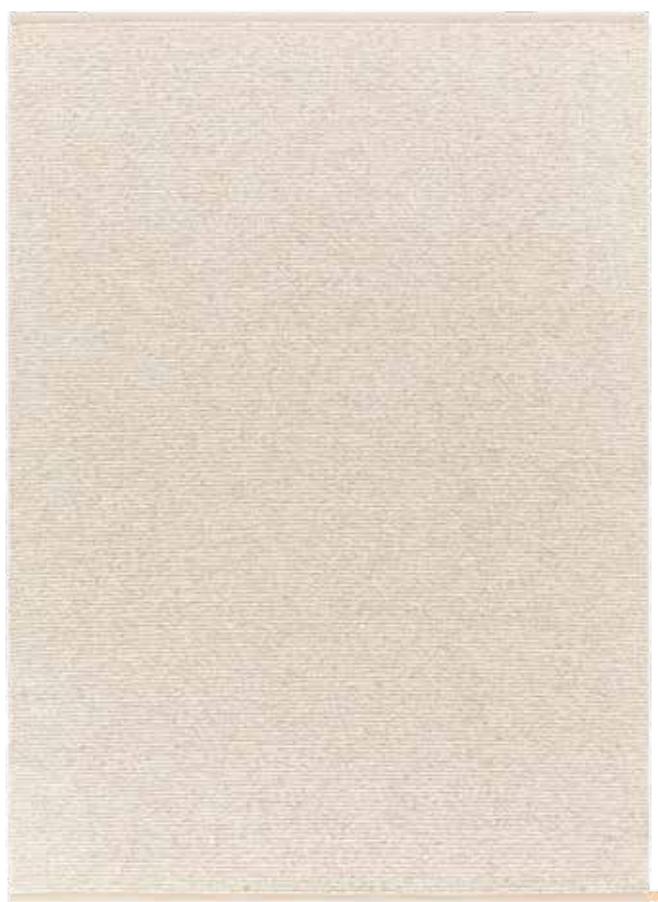
Rug 200x300 cm, Meringue 880