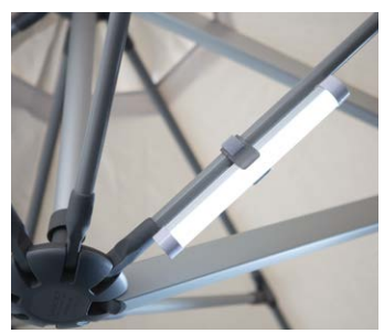
CLIP-ON LED LIGHTS Rechargeable LED light. Great for night-time entertaining.