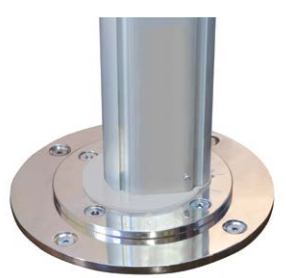
(316) SPIGOT & BASE PLATE Optional upgrade for coastal environments.