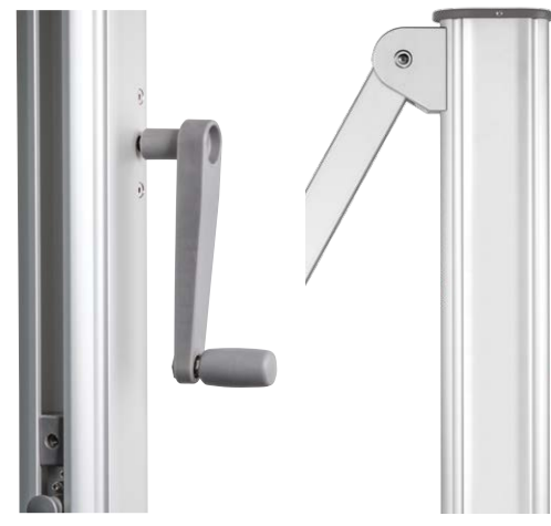
REMOVABLE WINDER HANDLE