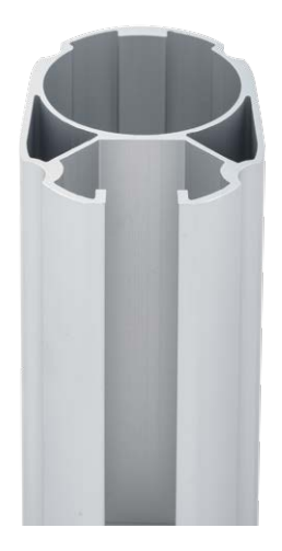
ANODISED ALUMINIUM MAST

Every component of the Riviera umbrella has been carefully developed and engineered to be strong and durable. At the same time we have designed the umbrella to have a sleek and clean appearance, free of unnecessary clutter.