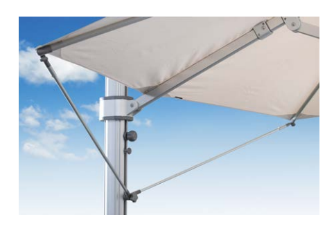
CANOPY STABILISER KIT Uniquely designed stabiliser arms that increase the umbrella's stability for commercial environments and exposed locations.