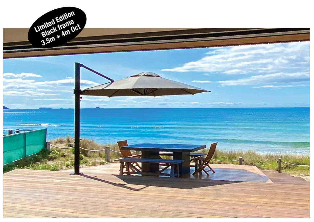
Black Frame Riviera with Charcoal R770 fabric. Installed at Tairua Beach, Coromandel.