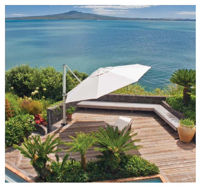
Riviera 4m Octagonal with Ecru fabric. Installed in Mission Bay, Auckland. New Zealand.